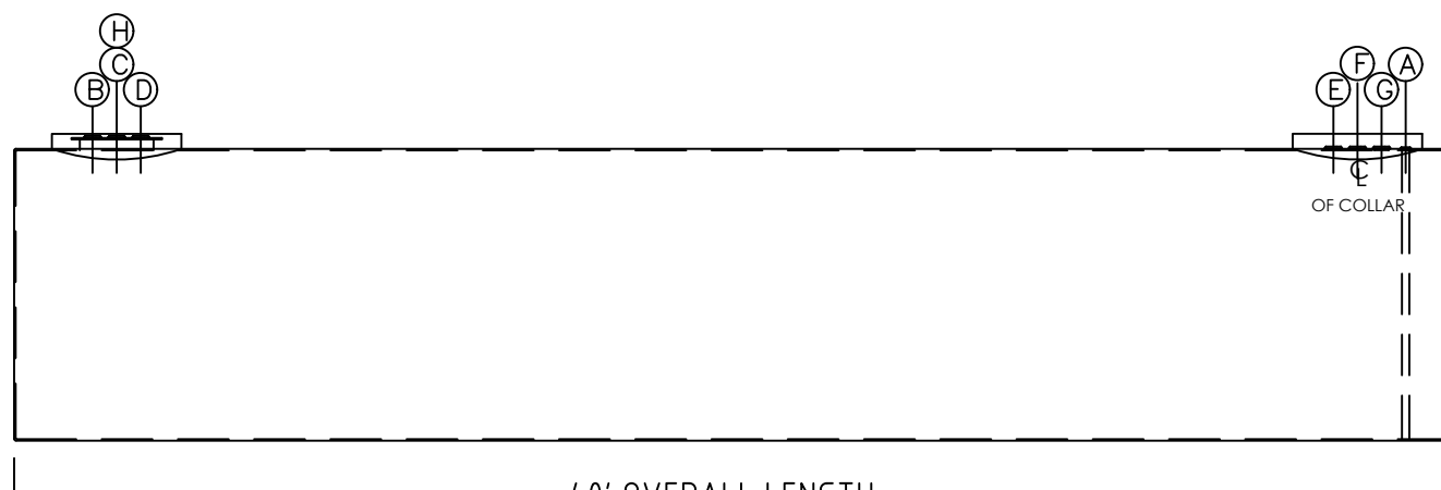
40' OVERALL LENGTH