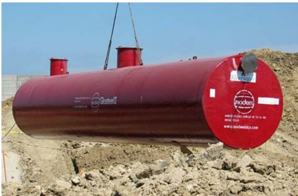
15,000 gallon Kleerwater Oil Water Separator used at D.F.W Airport

See working video at www.modweldco.com/Kleerwater_Oil_Water_Separators/kleerwater3.html