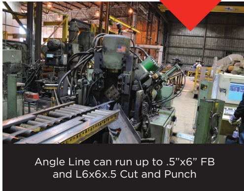
Angle Line can run up to .5"x6" FB and L6x6x.5 Cut and Punch