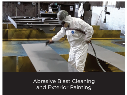
Abrasive Blast Cleaning and Exterior Painting