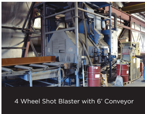
4 Wheel Shot Blaster with 6' Conveyor