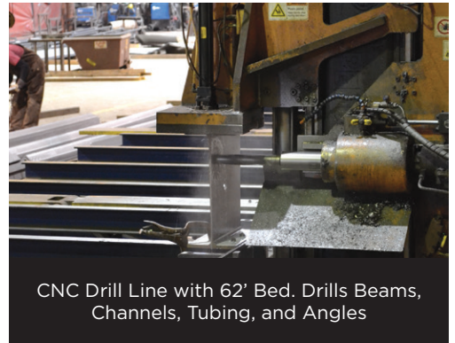
CNC Drill Line with 62' Bed. Drills Beams, Channels, Tubing, and Angles