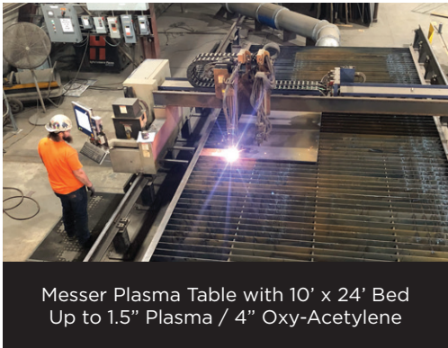
Messer Plasma Table with 10' x 24' Bed Up to 1.5" Plasma / 4" Oxy-Acetylene